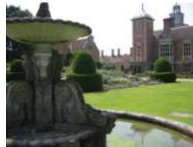
Blickling, Aylsham, Norfolk, Blickling Hall Estate, Garden with Fountain, 2007