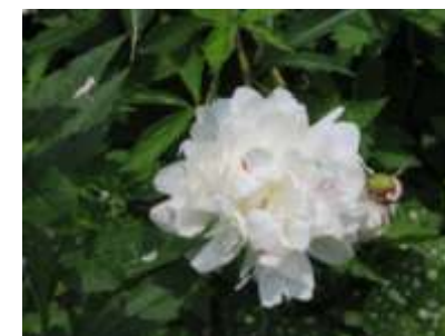
Woodbury, CT, Glebe House & Garden, White Peony, 060119