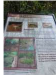
Bernardsville, NJ, Scherman-Hoffman Audubon Center, About Vernal Ponds, 081014