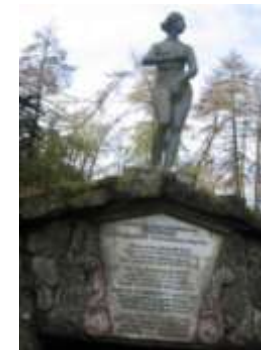
Oxfordshire, Rousham, Park Memorial, 033008