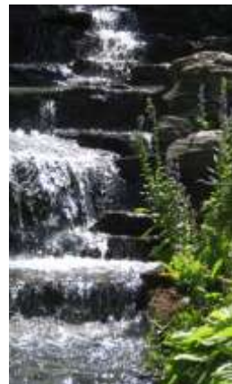
NYBG, Rock Garden, Flowing Water, 081914