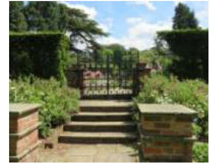
Harrogate, Newby Hall, Stairs to Elevated Formal Garden, 070416