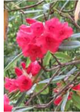
Grange Over Sands, Holker Hall & Gardens, Red Rhododendron Flowers, 070215