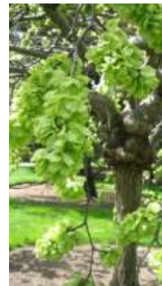
NYBG, Clumped Foliated Tree, 050111