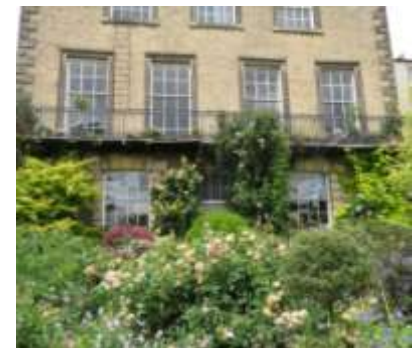
Richmond, Millbank Garden, B & B Facade & Garden, 070116