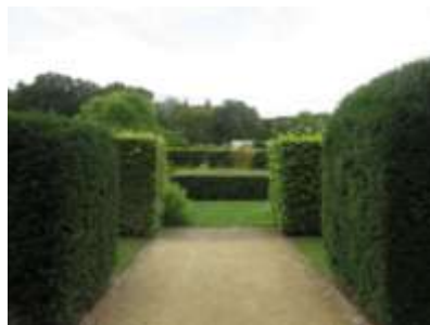
Scampston, Piet Oudolph's Symmetry in Hedges, 081518