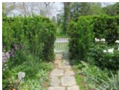
Woodbury, CT, Glebe House & Jeckyll Garden, From the Gate the Garden Begins, 060119