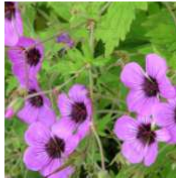
Scampston, Close-up on Large Purple Flowers, 072616