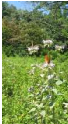
Bernardsville, NJ, Sherman-Hoffman Audubon Center, Butterflies Cavorting, 081014