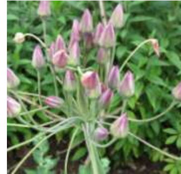
Grange Over Sands, Holker Hall & Gardens, Wild Onion Budding, 070215