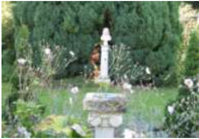
Chalfont, St. Giles, John Milton's Garden, 092008