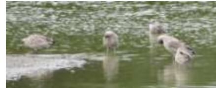
Filey Dams, Gathering of Herring Gulls, 072616