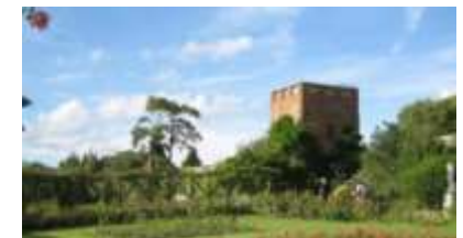
Dorking, Surrey, Polesden Lacey, Rose Garden, 081107