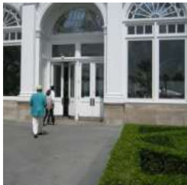
NYBG, Visitors Enter the Glass House, 050111