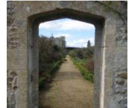
Oxfordshire, Rousham, Garden Entrance, 033008