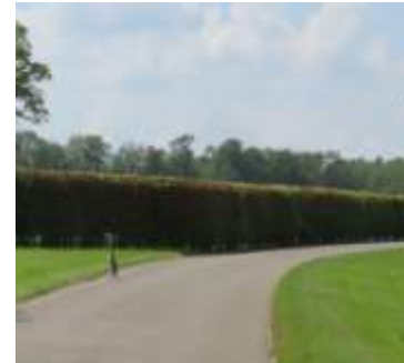
Gargrave House, The Drive with 3 Grey Herons, 061520