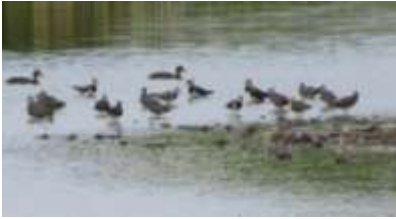
Filey Dams, Ducks & Lapwings Socializing, 072616