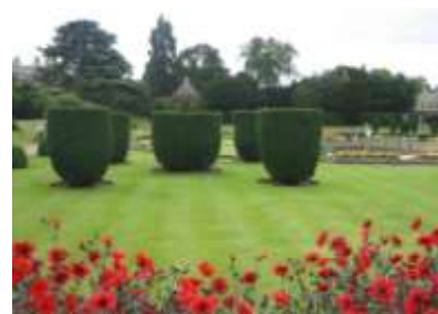
Grantham, Lincolnshire, Belton House, Formal Garden, 090207