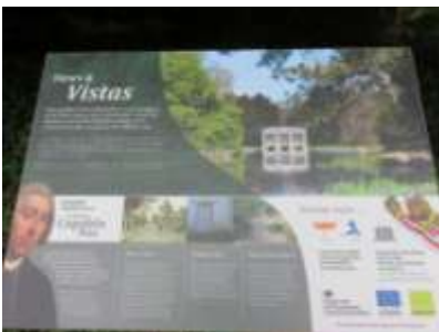
Scampston, Capability Brown's Role in the Garden, 072616