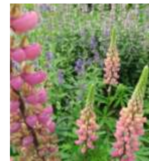
N. Yorkshire, York, Breezy Knees Garden, Lupin Flourishing, 070616