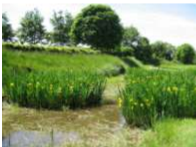
Avebury, Avebury Garden, Pond & Irises, 2007