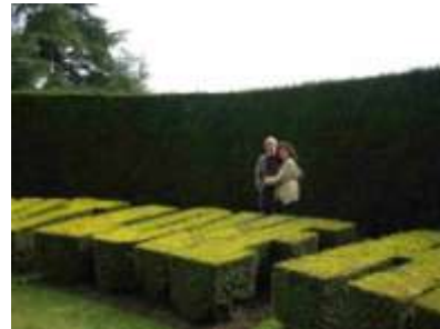
Ascott, UK, Ascott Yew Spells Love, 2007