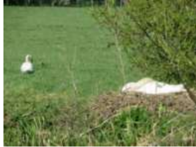
Gargrave Canal, Mute Swan on Nest with Partner in Field, 042520