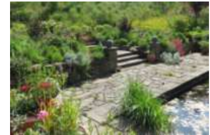
N. Yorkshire, Harlow Carr, Formal Garden with Sundial, 061215