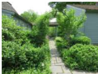
Woodbury, CT, Glebe House & Jeckyll Garden, Trademark Herbaceous Borders, 060119