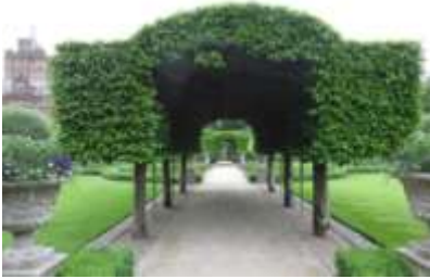
Grange Over Sands, Holker Hall & Gardens, Shaped Box Formality, 070215