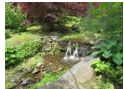
Southbury, CT, Hollister House Garden, Small Waterfall, 060119