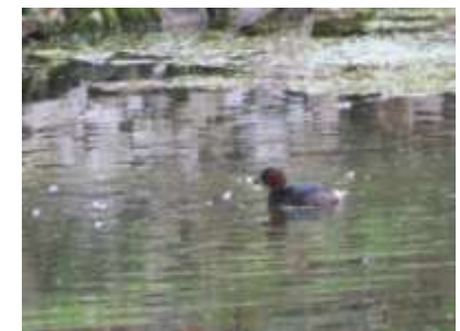
Sizergh, Dabchick or Little Grebe Prior To Diving For Weed, 093017