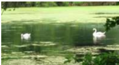
Alley Pond Park, Queens, Oakland Lake, Mute Swan Pair, 072614