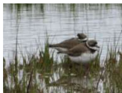
USA, Westerly, RI, Barn Island Wildlife Refuge, Pair of Semi-palmated Plovers, 052717