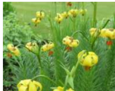
Inverary, Inverary Castle, Yellow Lilies in Garden, 060816