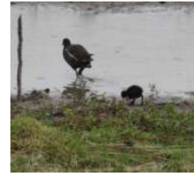
Filey Dams, Moorhen & Chick, 072615