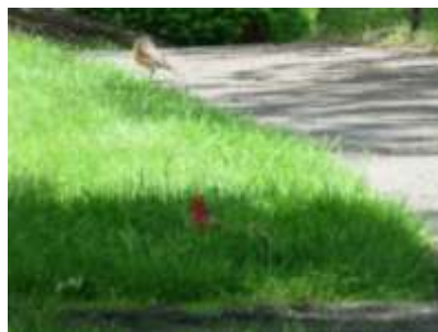
Southbury, CT, Heritage Village, Lake View Area, Cardinal Watching a American Robin, 060319