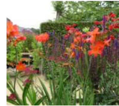
Scampston, Entrance Crocosmia "Spitfire" for Sale, 072616