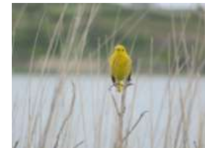
Block Island, Yellow Warbler Perched on Reeds in Wind, 052417