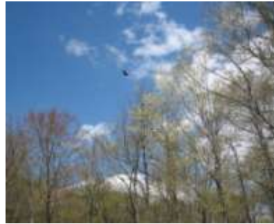
Sharon Audubon Centre, Hawk Soaring, 2011