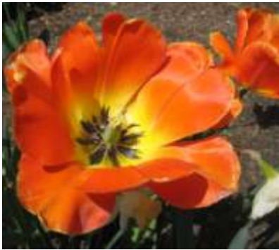
NYBG, Orange Tulip Close-up, 050111