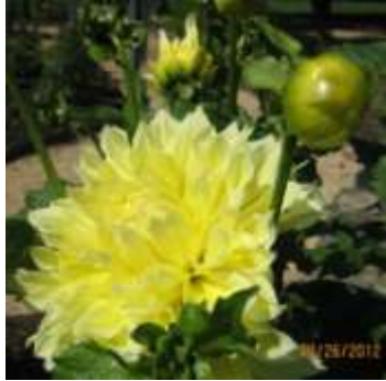
LI, NY, USA, Planting Fields Arboretum, Dahlia Close-up, 082612