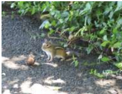
NYBG, Walkway w Chipmunk & Nut Half Consumed, 081914