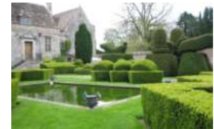
Avebury, UK, Avebury Garden, Formal Arrangement of Yew & Water, 2007