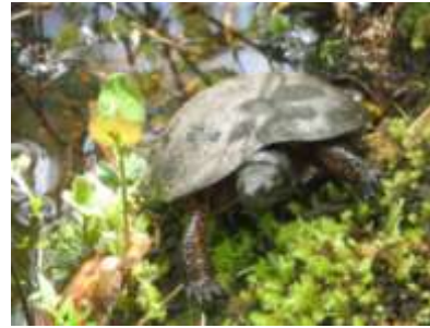
USA, Basking Ridge, Great Swamp, Box Turtle Shows His Face, 052417