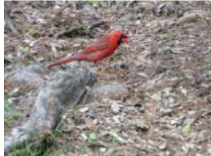
Southbury, CT, Heritage Village, Male Cardinal Lost in Thought, 060319