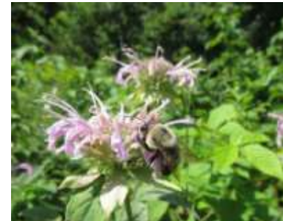
Bernardsville, NJ, Scherman-Hoffman Audubon Center, Bee on Wild Bergamot, 081014