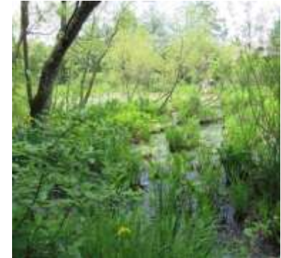
NYBG, Wetlands & Wild Iris, 052514