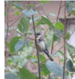
Gargrave House, Great Tit in our Birch Tree, 061520