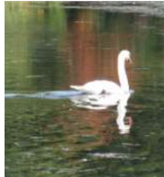
Smithtown, LI, Stump Lake, Gliding Swan & Reflection, 092814