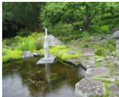
Winnepesaukee, NH, The Fells, Garden Sculpture of Heron, 2011