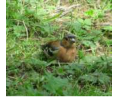
Harrogate, Harlow Carr, Chaffinch Resting in the Grass, 080118