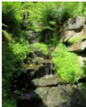
Harrogate, Newby Hall, Rockery Watery Trickle, 070416