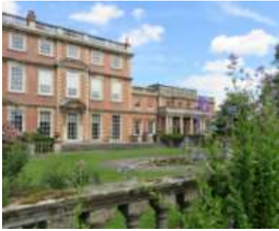
Harrogate, Newby Hall, Garden Fronting Estate House, 070416