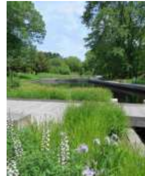
NYBG, Thain Water Garden, 052514