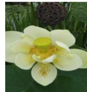
NYBG, Stages of a Water Lily, 050111