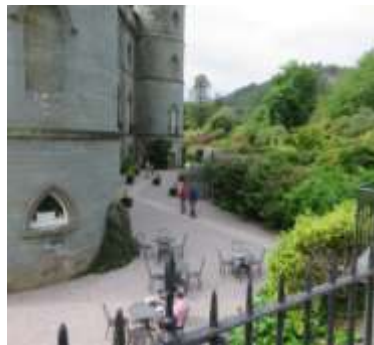
Inverary, Inverary Castle, Outside Seating For Teashop Amidst Dense