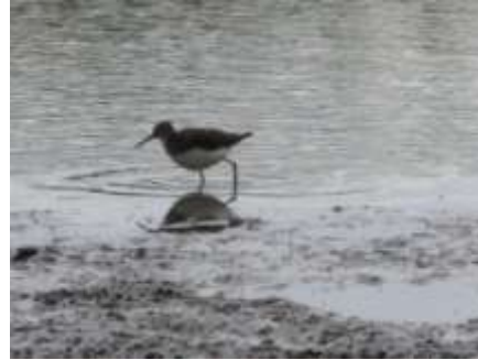
Filey Dams, Lone Common Sandpiper Looking for Food, 072616