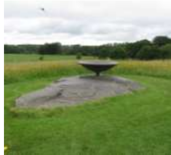
Grange Over Sands, Holker Hall & Gardens, Sundial Below Swooping Bird, 070215