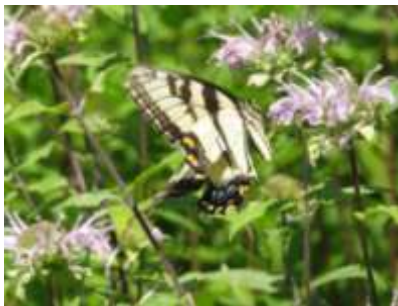
Bernardsville, NJ, Sherman-Hoffman Audubon Center, Monarch Butterfly on Bergamot Close-up, 081014