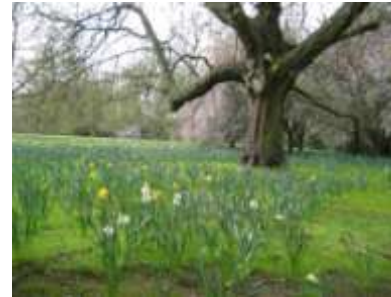
Ascott, UK Entrance to the Garden, 2007