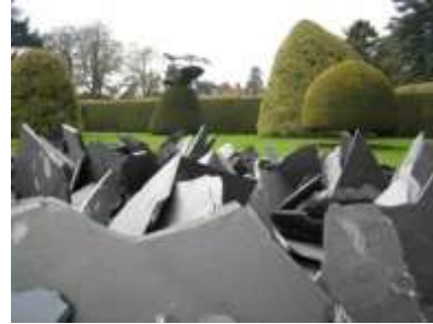
Ascott, UK, Ascott Garden, Slate Sculpture, 2007