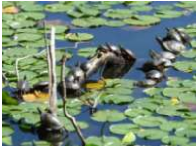
Mt. Pleasant, NY, Rockefeller State Park, Eighteen Turtles Sunning Themselves, 091414