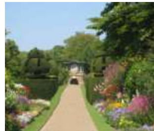
Haywards Heath, W. Sussex, Nyman's Garden, Formal Rows of Topiary & Wild Flowers, Path to Garden Structure, 081107