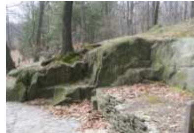
NYBG, Rock Along the Bronx River, 031812