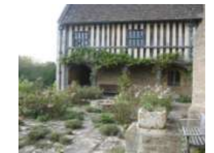
Great Chalfield, Great Chalfield Manor & Garden, Random Plantings in the Courtyard, 2007