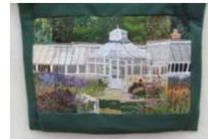
Scampston, Needlework of Richardson Conservatory, 072616