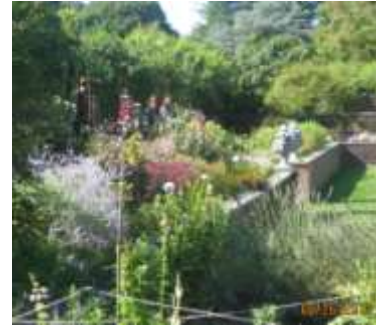
LI, NY, USA, Planting Fields Arboretum, Wildflower Garden, 082612