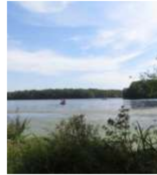
Smithtown, LI, Stump Lake, As Many Birds As Fishermen, 092814