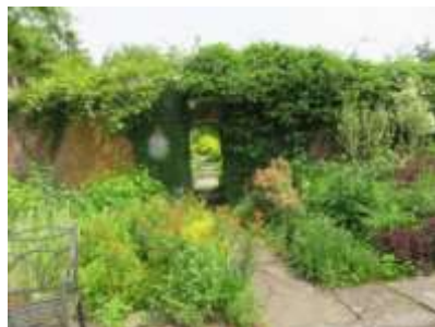
Southbury, CT, Hollister House Garden, Leaving the Walled Area, 060119