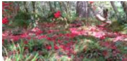
Inverary, Crarae, Carpet of Red Rhododendron, 060716