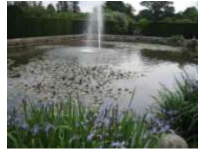
Tonbridge, Kent, Penshurst Place, Water Garden & Flowers, 060708