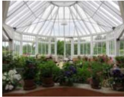
Scampston, Rotunda Interior of Conservatory, 072616