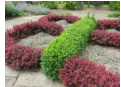
N. Yorkshire, York, Breezy Knees Garden, Topiary Butterfly, 070616