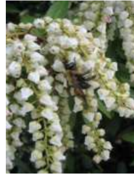
NYBG, Bell-like Flowering Tree with Bee, 050111