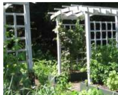
NYBG, Home Garden Center Trellises Amidst Edible Garden Offerings, 081914