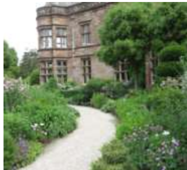
Grange Over Sands, Holker Hall & Gardens, Path Past House, 070215