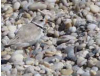
USA, Setauket, LI, West Meadow Beach, Piping Plover Camouflaged, 060117