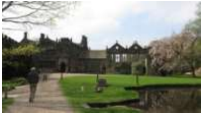
N. Yorkshire, East Riddlesden Hall, Brian Walks Up to the Hall, 051515