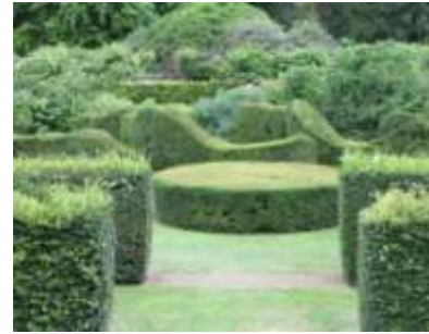
Scampston, Mix of Box Shapes, 072616