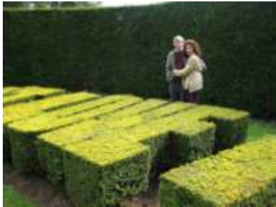
Ascott, UK, Ascott Garden, Yew Adhears to "All You Need Is Love", 2007