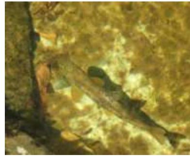
Inverary, Crarae, Large Dog Fish Swimming, 060716