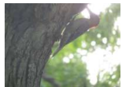
USA, Westerly, RI, Kettle Pond Nature Reserve, Red Bellied Woodpecker, Looking for Grubs, 052717