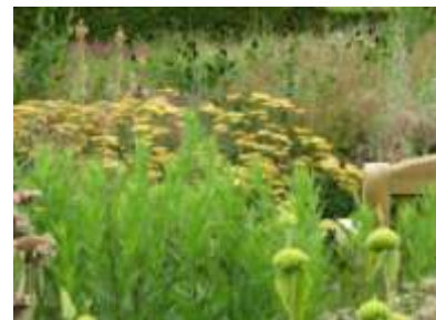
Scampston, Yellow Daisies Surrounded, 072616