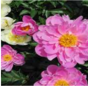
NYBG, Multi-coloured Peonies, 052514