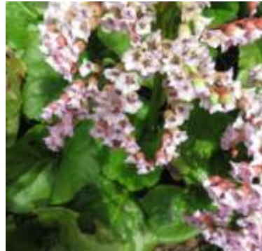
N. Yorkshire, East Riddlesden Hall, Lush Pink Flowering Bush, 051515