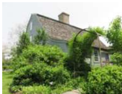
Woodbury, CT, Glebe House & Garden, House Accentuated by Bushes, 060119