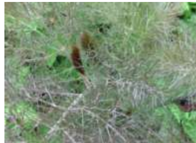
N. Yorkshire, East Riddlesden Hall, Lush Lace of Nature, 051515