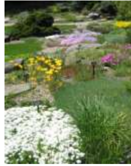
NYBG, Profusion of Flowers Amidst Rocks, 050111