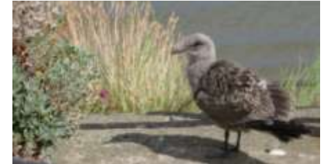
Robin Hood's Bay, Young Juvenile Gull on a Wall, 072716