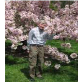
NYBG, Brian & Cherry Tree, 050111