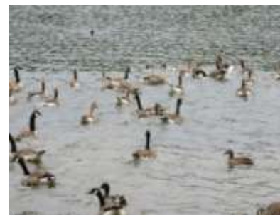
Clumber Park, Nottinghamshire, Canadian Geese Socializing, 062317