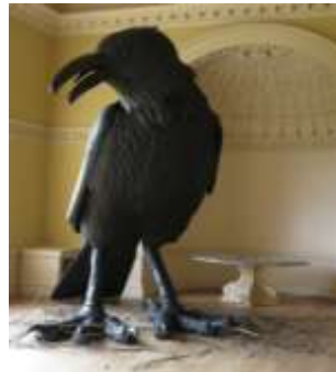
Fountains Abbey, Banqueting Hall Crow Sculpture, 082915