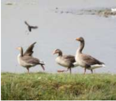
Filey Dams, Noisy Greylags Patrolling, 072616