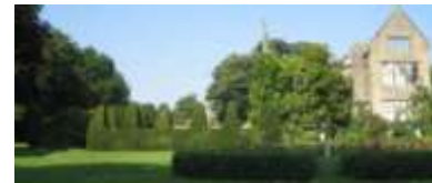
Haywards Heath, W. Sussex, Nyman's Garden, Row of Box by Manor, 081107