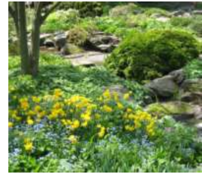
NYBG, Rock Garden Daffs & Blue Flowers, 050111