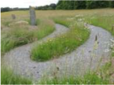
Grange Over Sands, Holker Hall & Gardens, Curving Maze Path in Stone, 070215