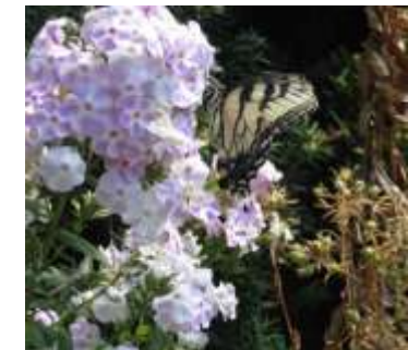
NYBG, Irwin Perennial Garden, Eastern Tiger Swallowtail Butterfly on Flower, 081914