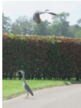
Gargrave House, The Drive with 2 Juvenile Grey Herons, 061520