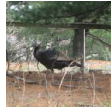
Wild Turkey, NY Botanical Garden, 031812