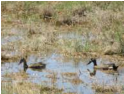
Roswell, NM, Bitter Lake Natl. Wildlife Refuge, Pair of Blue-winged Teals, 2018