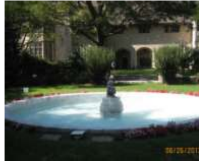
LI, NY, USA, Planting Fields Arboretum, Coe Mansion Behind the Fountain, 082616