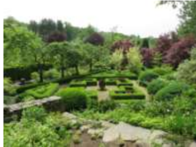
Southbury, CT, Hollister House Garden, Small Formal Box Garden, 060119