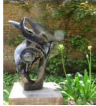
Harrogate, Newby Hall, Zimbabwean Sculpture, 070416