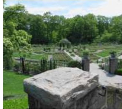
NYBG, Rockefeller Rose Garden, Still Bare, 052514