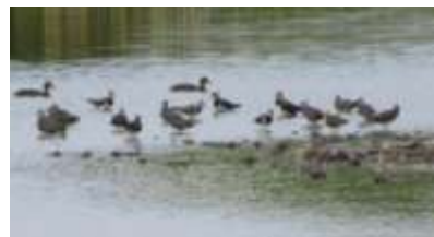
Filey Dams, Ducks Floating Past Congregating Lapwings, 072616