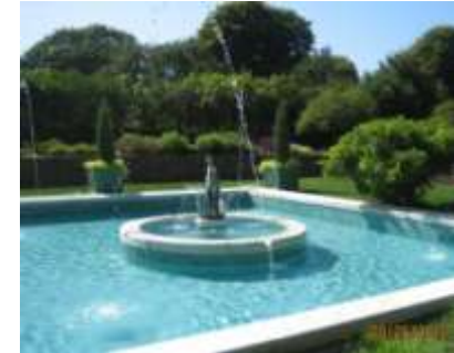
LI, NY, USA, Planting Fields Arboretum, Pool in Formal Setting, 082612