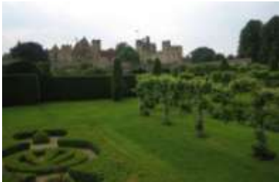
Tonbridge, Kent, Penshurst Place, Expansive Garden, 060708