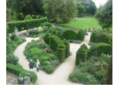
Grange Over Sands, Holker Hall & Gardens, Looking Down on the Walled Garden, 070215