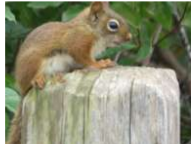
Wells, Maine, Estuarine Research Center, Baby Red Squirrel Frozen in Place, 2018