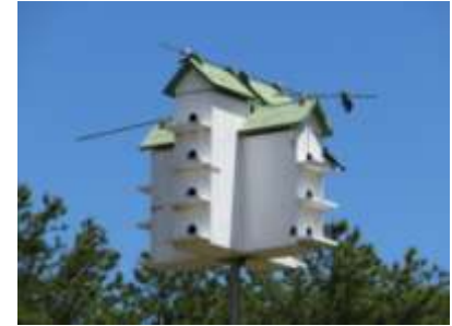
USA, Quogue Wildlife Sanctuary, LI, Bird Apartment with Several Visible Tenants, 051717