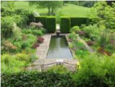
Southbury, CT, Hollister House Garden, Overlooking One Pool, 060119