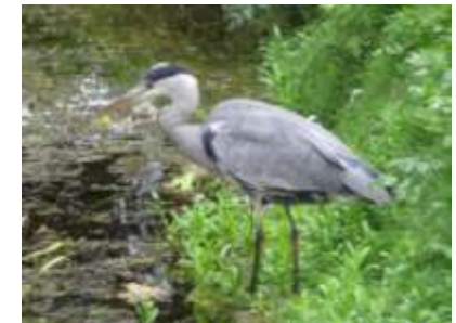
Glasnevin Botanic Garden, Ireland, Grey Heron Up Close, 090417