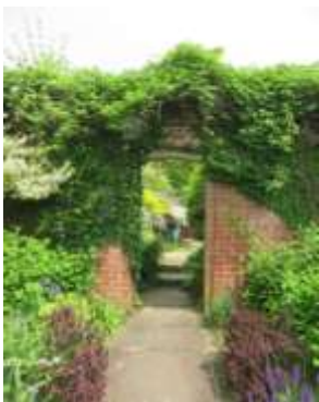
Southbury, CT, Hollister House Garden, Brick Wall Separates Elements of the Garden, 060119