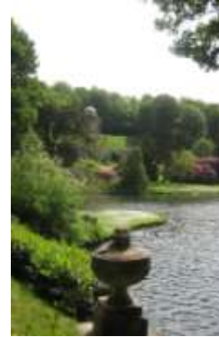
Stourhead, Classical Temple, & Lake with Azaleas, 2007