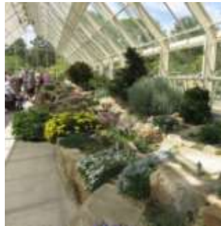
N. Yorkshire, Harlow Carr, Alpine Greenhouse, 061215