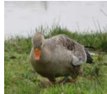
Filey Dams, Goose Close Up, 072615