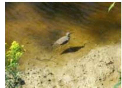
Maine, Saco-Biddeford Rachel Carson National Wildlife Refuge, Yellowleg Wader, 2018