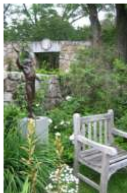
Winnepesaukee, NH, The Fells, Wall, Figure & Seating Area with Plantings, 2011