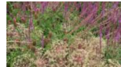
Scampston, Contrast of Thin Cones of Pink with Cloud-like Puffs, 072616