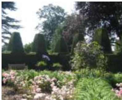
Haywards Heath, W. Sussex, Nyman's Garden, Flowers & Topiary, 081107