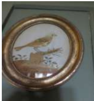
East Riddlesden Hall, Framed Bird, 051515