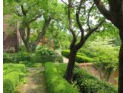
Southbury, CT, Hollister House Garden, Walking Along the Garden, 060119