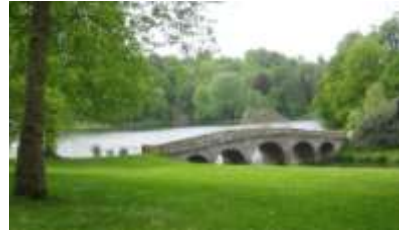
Mere, Wiltshire, Stourhead, Bridge in Garden Along Water Feature, 2007