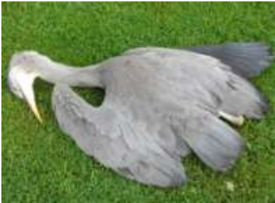
Gargrave House, Front Lawn, Dead Heron, Beautiful in Death, 061715