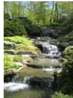
NYBG, Rock Garden Waterfall on Rocks, 050111