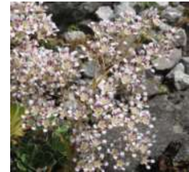
N. Yorkshire, Harlow Carr, Variegated Alpine Flowers, 061215