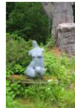
Winnepesaukee, NH, The Fells, Garden Torso Sculpture, 2011