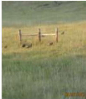
South Dakota, USA, Custer State Park, Sheridan Lake Road, Wild Turkeys, 090212