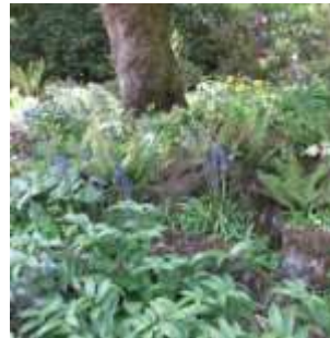
N. Yorkshire, Harlow Carr, Variety of Wildflowers Form Tree Carpet, 061215