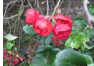
N. Yorkshire, East Riddlesden Hall, Bright Red Blossoms on Wall-Creeping Bush, 051515