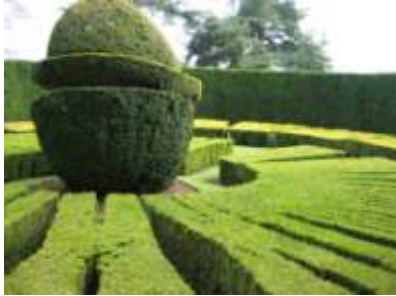
Ascott, UK Ascott Yew Garden, Modern Sculpture in Hedge, 2007