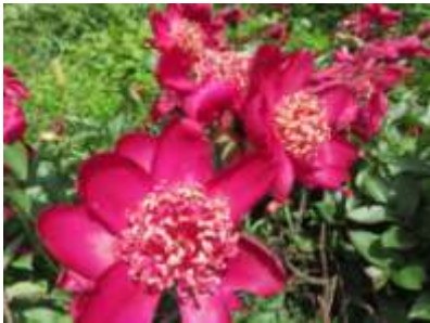
Harrogate, Newby Hall, Vibrant Red Peonies, 070416