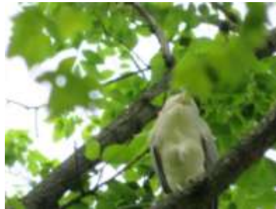
Great Swamp, Basking Ridge, Black Capped Night Heron, 051417