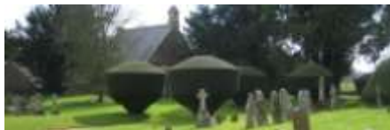
Oxfordshire, Rousham, Church & Topiary In Cemetery, 033008