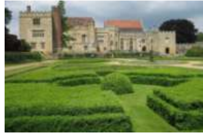
Tonbridge, Kent, Penshurst Place, Home, 060708