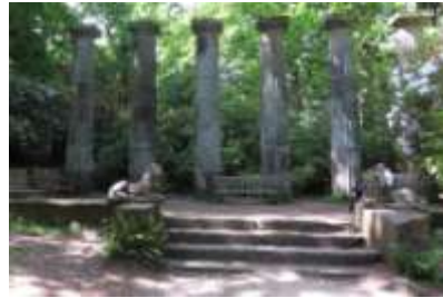
N. Yorkshire, Harlow Carr, Columned Lion Seating Area, 061215