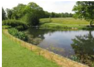
N. Yorkshire, Harlow Carr, Queen Mother's Lake, 061215