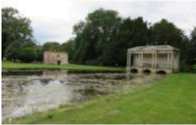
Scampston, Palladian Bridge & Pump House, 072616