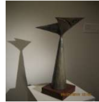
Max Ernst, Bird, Portland, Maine, 2013