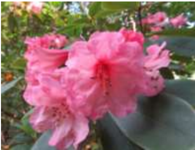
Inverary, Crarae, Molly Montrose Rhododendron, 060716