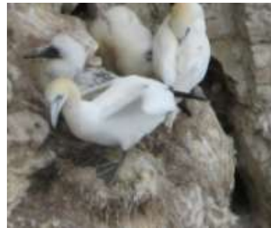
Bempton Cliffs, Filey, Young Gannets On Cliff Face, 072616