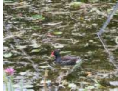
Glesnevin Natl. Botanic Garden, Carrion Crow Greyleg, 090417