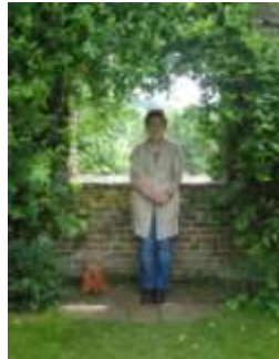
Tonbridge, Kent, Penshurst Place, Judith Against the Wall, 060708