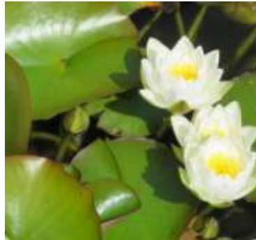
Harrogate, Newby Hall, Garden Lilies in the Sunshine, 070416