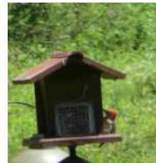
Red-bellied Woodpecker, Bent of the River Audubon Centre, Southbury, CT, 051714