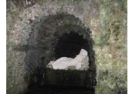
Mere, Wiltshire, Stourhead Landscape Garden, Grotto, 2007