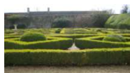
Oxfordshire, Rousham, Maze, 033008