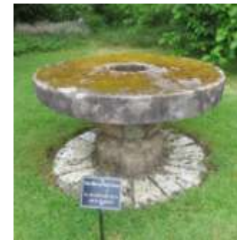
Inverary, Inverary Castle, Haunted Old Mill Stone in Grounds, 060816