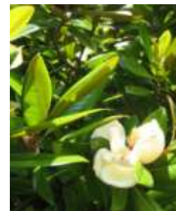
Haywards Heath, W. Sussex, Nyman's Garden, Gardenia, 081107