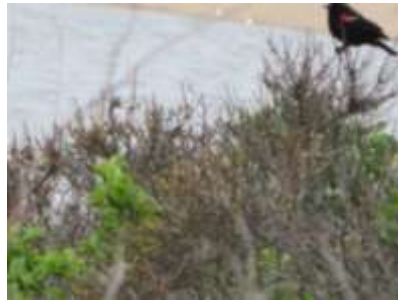
USA, Block Island, Red-Winged Blackbird on Beach Scrub, 052417