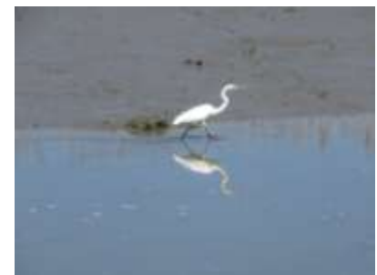
Queens, NY, Alley Pond Park, Great Egret Wading on the Hunt for Fish with Reflection, 051119