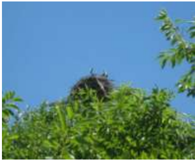
Jamaica Bay Wildlife Refuge, Young Osprey in Nest, 071310