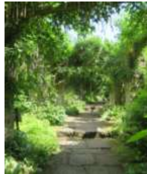
Harrogate, Newby Hall, Stepped Walkway, 070416