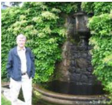
Winnepesaukee, NH, The Fells, Brian & Garden Fountain, 2011