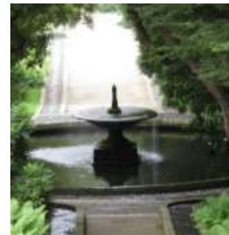
Grange Over Sands, Holker Hall & Gardens, Fountain Close-up, 070215