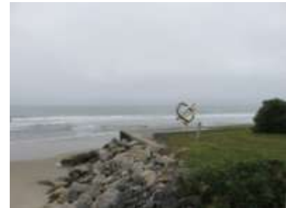
Wells, Maine, Estuarine Research Center, Coastal View with Sculpture, 2018