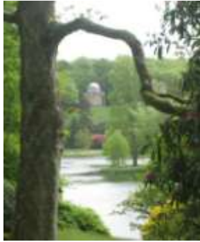
Mere, Wiltshire, Stourhead House & Landscape Garden, 2007