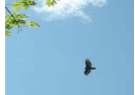
Southbury, CT, Heritage Village, Hawk Circling On a Hunt for Food, 053119