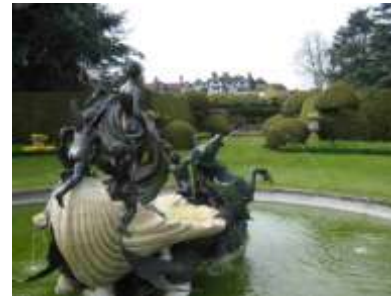
Ascott, UK, Ascott Garden, Rothschild Family Fountain, 2007