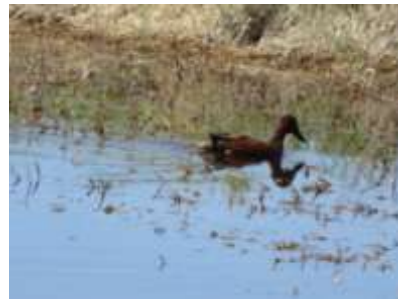
Roswell, NM, Bitter Lake Natl. Wildlife Refuge, Cinnamon Teal Enjoying The Area, 2018