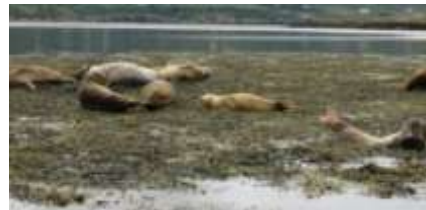
Isle of Skye, Grey Seals Cavorting & Resting at Low Tide, 061316