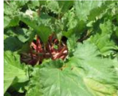
N. Yorkshire, Harlow Carr, Rhubarb in Family Garden, 061215