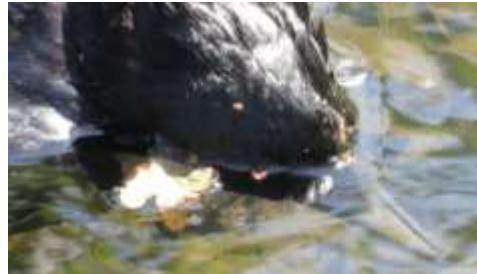
Harlow Carr, Dead Crow in a Stream, 061215