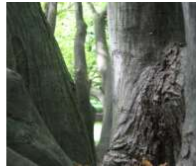
NYBG, Tree Wood, 050111