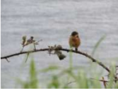
Northern Ireland, Carrick-a-Rede Rope Bridge Walk, Stonechat Resting on Berry Branch, 091319