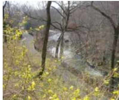
NYBG, Over View of Bronx River Thru Forsythia, 031812