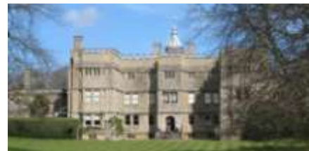
Oxfordshire, Rousham, Estate House & Surrounding Green, 033008