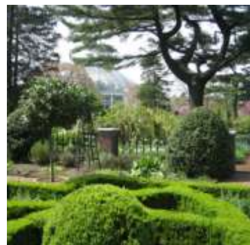
NYBG, Formal Box Garden , 050111