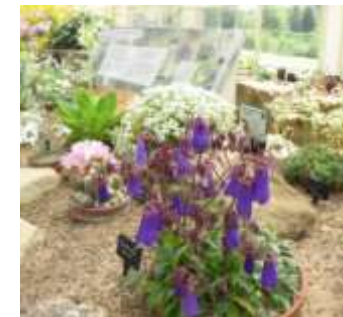
N. Yorkshire, Harlow Carr, Alpine Greenhouse Flowering Group, 061215