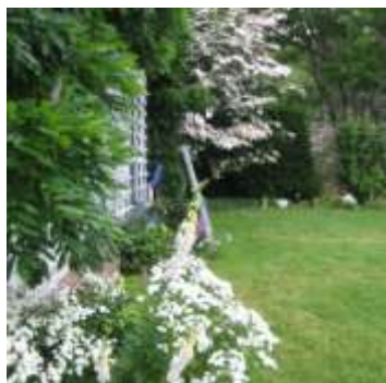
Winnepesaukee, NH, The Fells, Garden View, 2011