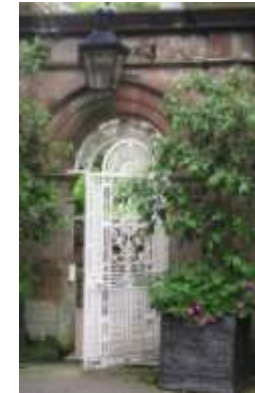
Grange Over Sands, Holker Hall & Gardens, Entry to Private Wing, 070215