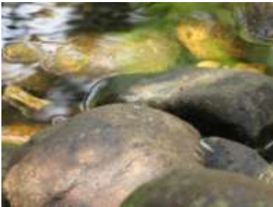
Inverary, Crarae, Water & Sun on Stones, 060716