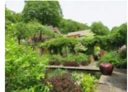
Southbury, CT, Hollister House Garden, View of the Walled Garden, 060119