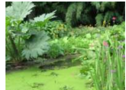
Harrogate, Newby Hall, Garden Pond Covered in Green, 070416