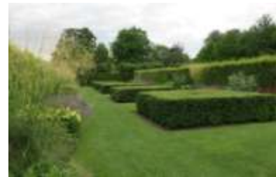
Scampston, Box Rows Against Flowering Plants, 072616