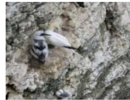
Bempton Cliffs, Filey, Gannets Youth & Adult, 072616