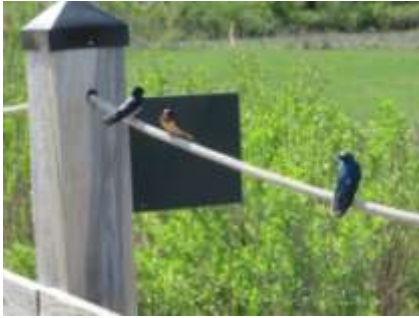
Queens, NY, Alley Pond Park, Tree Swallow Has Attracted Company, 051119