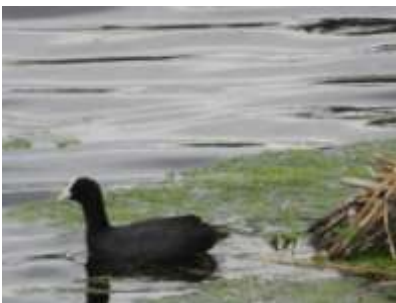
Clumber Park Coot, Just Outside Nest, 062317