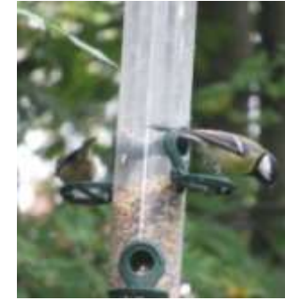
Harlow Carr Bird Feeder, Nuthatch Feeding, 101715