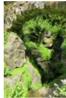
Harrogate, Newby Hall, Rockery Arch of Stone, 070416