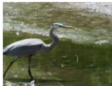
Southbury, CT, Heritage Village, Lake View Area, Great Blue Heron Looking for Tadpoles, 060319