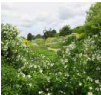
N. Yorkshire, York, Breezy Knees Garden, Lush Bushes in Flower, 070616