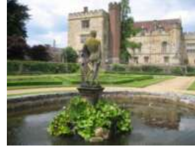
Tonbridge, Kent, Penshurst Place, Fountain Statue, 060708