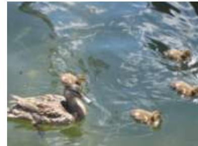
Lake Winnepesaukee, NH, Mallard & Chicks, 070411