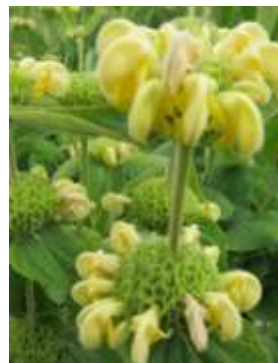
N. Yorkshire, York, Breezy Knees Garden, Exotic Wildflowers, 070616