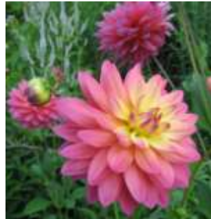
Haywards Heath, W. Sussex, Nyman's Garden, Dahlias, 081107