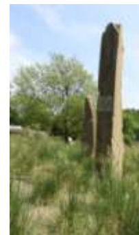
N. Yorkshire, Harlow Carr, Quarried Standing Stones, 061215