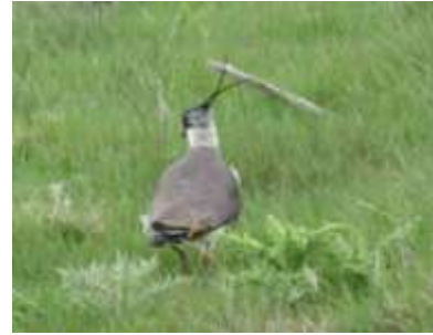
Nidderdale, Coldstones Cut, Lapwing Showing Head Plume, 060815