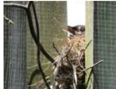
USA, Basking Ridge, Mother Robin Sitting on Nest, 051417