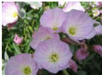
Woodbury, CT, Glebe House & Jeckyll Garden, Close-up on Flowers, 061911