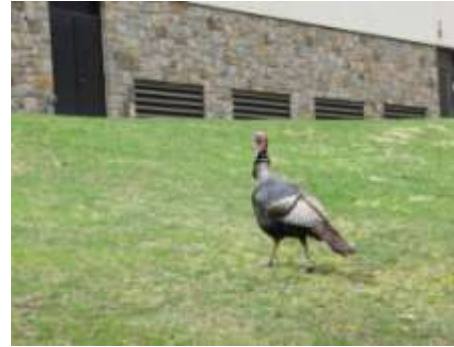
Southbury, CT, Fairfield University, Wild Turkey Resident, 041119