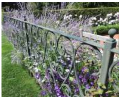
NYBG, Irwin Perennial Garden, Fence w Blue Flowers, 081914