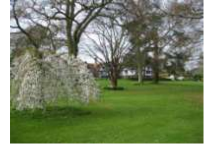
Ascott, UK, Ascott Garden, Weeping Cherry Tree, 2007