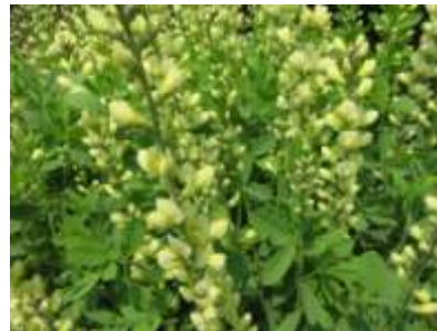
Southbury, CT, Hollister House Garden, Lush Greystone Bush, 060119