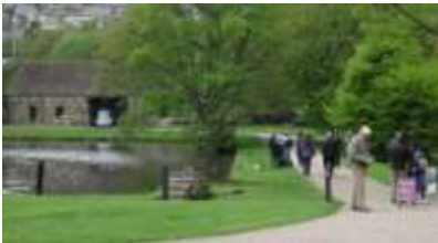
N. Yorkshire, East Riddlesden Hall, Pond & Mallards on Grounds with Visitors, 051515