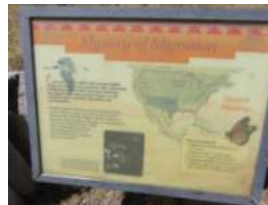
Roswell, NM, Bitter Lake Natl. Wildlife Refuge, Migration Explained, 2018