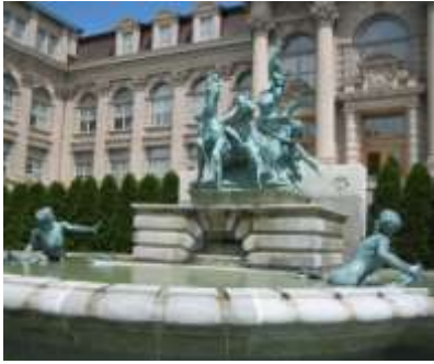
NYBG, Meeting Facility & Nymphs in Fountain, 050111