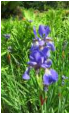
Inverary, Crarae, Irises Framed with Green, 060716