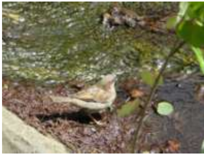
USA, Pittsburgh, Phipps Conservatory, Eurasian House Sparrow in Japanese Garden Stream, 051017