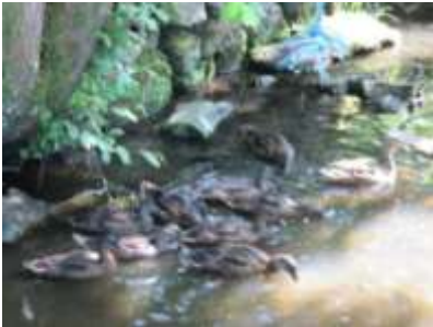
Gargrave, Female Mallards, Eating Insects & Weed Voraciously in Markhouse Lane Stream, 090619