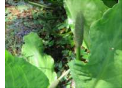
Inverary, Crarae, Skunk Cabbage in Wet Setting, 060716