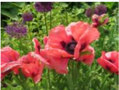
N. Yorkshire, Harlow Carr, Poppies & Purple Pompoms, 061215