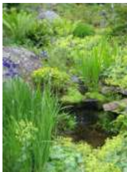
Winnepesaukee, NH, The Fells, Alpine Garden Irises, 2011