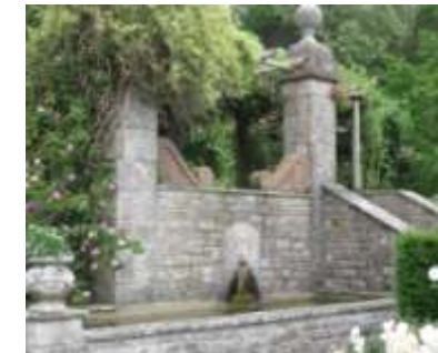
Grange Over Sands, Holker Hall & Gardens, Garden Wall & Trellis, 070215