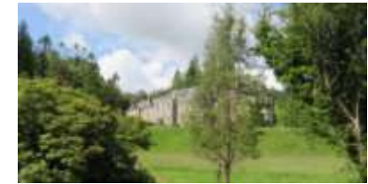
Inverary, Crarae, View of Sir George's House, 060716