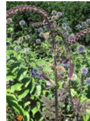
NYBG, Irwin Perennial Garden, Close-up on Curling Cones, 081914