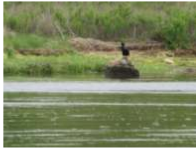
USA, Westerly, RI, Barn Island Wildlife Refuge, Cormorant on Distant Rock, 052717