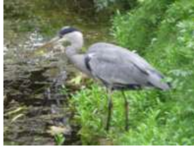
Glesnevin Natl. Botanic Garden, Grey Heron Up Close Fishing, 090417