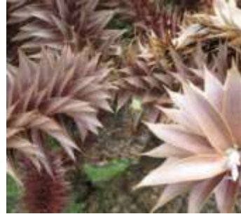
Grange Over Sands, Holker Hall & Gardens, Aspect of Monkey Slipping Tree, 070215