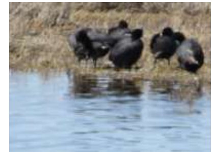
Roswell, NM, Bitter Lake Natl. Wildlife Refuge, Gathering of American Coots, 2018