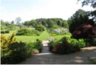
N. Yorkshire, Harlow Carr, Overlook of Main Garden Area, 061215