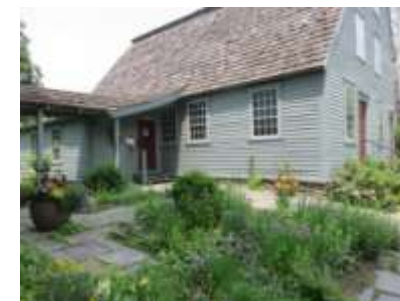
Woodbury CT, Glebe House & Jeckyll Garden, Plantings Amidst Paving Stones, 060119