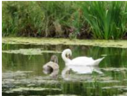
Scampston Gardens, Mute Swan with Chick, Peaceful Sojourn, 072616