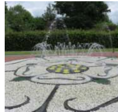
N. Yorkshire, York, Breezy Knees Garden, Fountain Display, 070616