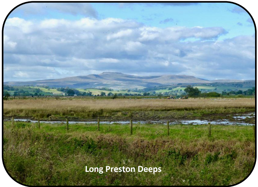
Long Preston Deeps

If you are interested in birds or just enjoy watching them this is the Group for you.